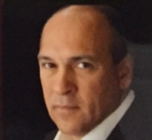
SINGING SENSATION "TONIO TORTELLINI"