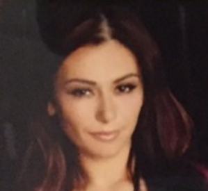
STAR OF JERSEY SHORE "MIRABELLA CANNOLI"