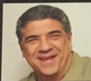
STAR OF THE SOPRANOS "DOMINIC CANNOLI"