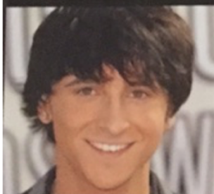
DISNEY CHANNEL STAR "JOEY CANNOLI"