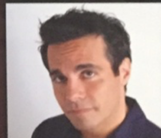
STAR OF SEX AND THE CITY "NICKY CANNOLI"